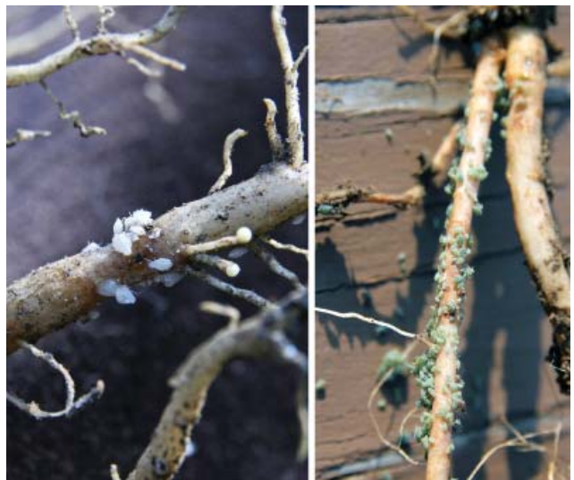
Two different species of aphids infesting roots.

Many species are green, but others are white, yellow, red (pink), brown, black, or mottled. And many species have two color types, such as the green peach aphid, which has both a green and a red form. Some, such as the cabbage aphid or woolly apple aphid, secrete a white or gray waxy substance that covers the body. Adult aphids may be winged or wingless. They have sucking mouthparts and feed exclusively on plant sap. Aphids feed on stems, leaves, and even roots! They reproduce rapidly to form colonies or clumps, particularly on new growth.