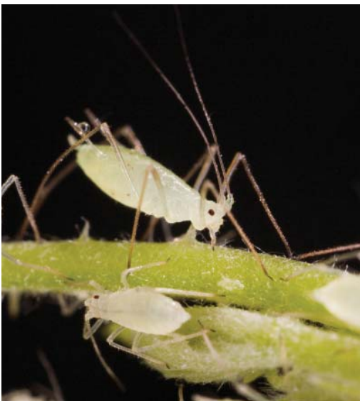
The raspberry aphid, Amphorophora agathonica , has been identified as a major culprit in spreading black raspberry necrosis virus and raspberry mottle virus. Photo by Stephen Ausmus, ARS Image Number D992-20.

Ants will protect the aphids from natural enemies and will actually carry them to new plants when the food source is depleted. Some ants even go so far as to build small shelters for the aphids or to keeping root-feeding aphids inside their own nests. A few species of aphids have become so dependent on their