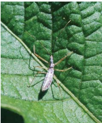
Nabid bugs and other predators will eat aphids.

There are many other arthropods that will eat aphids if given the chance including bigeyed bugs, damsel bugs (Nabidae), earwigs, ground beetles (Carabidae), rove beetles (Staphylinidae), spiders and harvestmen, as well as small passerine birds such as goldfinches and sparrows, and other animals.