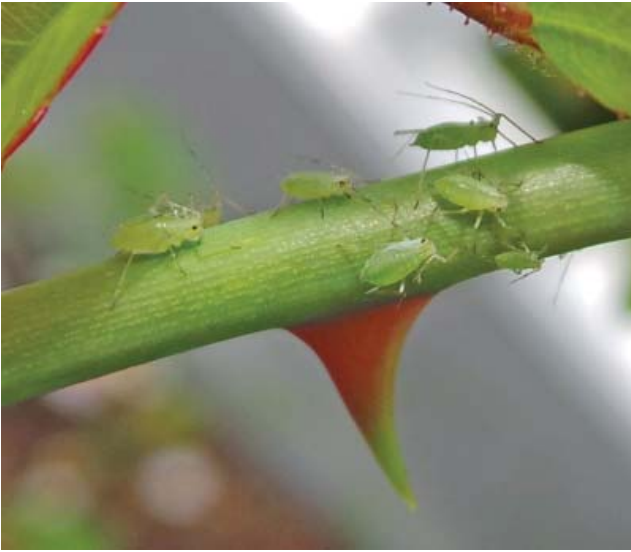
Aphids feeding on a rose plant, with their mouthparts inserted into the stem to suck out sap.

In order to get enough nitrogen in their diet, aphids must ingest far more sugar and liquid than they need. They have special filters in their digestive system to help excrete the excess sugar water, called honeydew. This sticky honeydew coats the plant's leaves, other plants, picnic tables, cars or anything else below where the aphids are feeding. Sooty molds may develop on the honeydew, covering the plant's leaves with unattractive black growth, and reducing the photosynthetic ability of the plant.