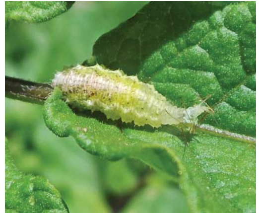
A syrphid fly larva feeding on an aphid.

Hover flies (Syrphidae) – also called flower flies or syrphids, the adult resemble honey bees or wasps, but it's the slug-like, pale green to yellow maggots that eat aphids.