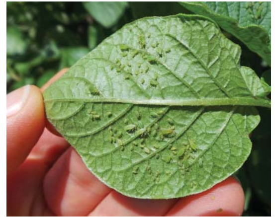
Green peach aphid on a potato leaf.

Woolly apple aphid, Eriosoma lanigerum , feeds on the bark and roots of apple, causing a swollen gall to form on the stems where aphids have fed. They also produce waxy filaments on the abdomen, creating a woolly appearance.