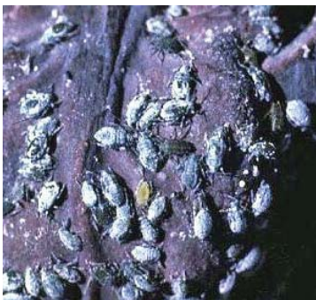
Cabbage aphid, Brevicoryne brassicae , on red cabbage.

Many species are green, but others are white, yellow, red (pink), brown, black, or mottled. And many species have two color types, such as the green peach aphid, which has both a green and a red form. Some, such as the cabbage aphid or woolly apple aphid, secrete a white or gray waxy substance that covers the body. Adult aphids may be winged or wingless. They have sucking mouthparts and feed exclusively on plant sap. Aphids feed on stems, leaves, and even roots! They reproduce rapidly to form colonies or clumps, particularly on new growth.