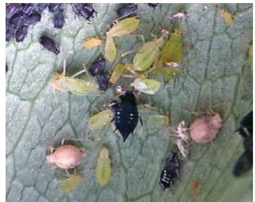
Two tan mummies of parasitized aphids sit among healthy aphids.

But should you do anything about the aphids? That depends their absolute numbers, whether any natural enemies are present, if honeydew is causing problems, the size of the plant and if the plant's growth is being affected, and your tolerance for their presence. Natural controls often bring aphid populations under control shortly after they become noticeable. If there are numerous lady bird beetles or lacewing larvae on the plant, or many aphids are parasitized (are mummies), those natural controls should be given a chance to do the job first. Avoid using broad spectrum insecticides that could kill these natural enemies.