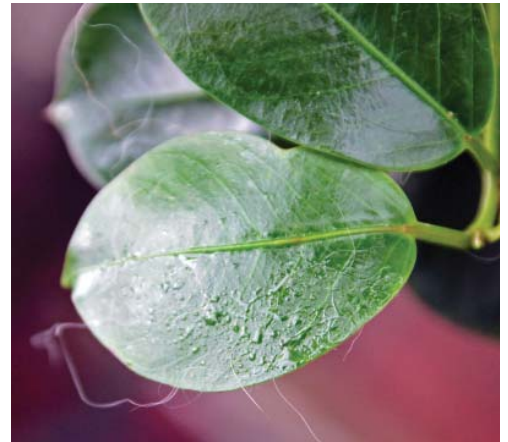
Sticky honeydew on a mandevilla leaf.

Plant phloem has lots of sugars but not many amino-acids or nitrogen.