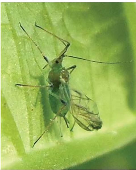
A winged aphid.

After several generations, when the food supply becomes short, or the area becomes overcrowded, winged females (alates) appear. These winged females fly to new host plants and produce many more generations of wingless females. At the end of the summer, when temperatures begin to drop and daylength decreases, both males and females are produced. These aphids mate and the females lay eggs on the appropriate host plant.