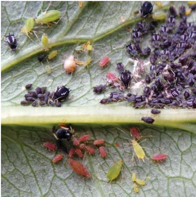
Aphids are common soft-bodied insects that can be many different colors.

Aphids are primarily northern temperate zone insects all in the family Aphididae of the order Hemiptera, with about 1,350 species in North America (5,000 worldwide), although only a handful are considered serious pests. Most aphids are about 1/8 inch long and all are soft-bodied. Their pear-shaped bodies have “exhaust pipes” (cornicles) protruding from the back end of the abdomen (used to exude droplets of a quick-hardening defensive fluid called cornicle wax).