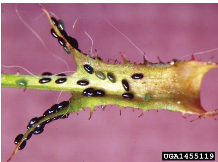
Rose aphid eggs.

The life cycle of most species is rather complex. In Wisconsin aphids spend the winter as eggs. When these hatch in the spring, they produce only wingless females that give birth to live young (viviparity; without mating = parthenogenetic reproduction). Each female aphid reproduces for a period of 20–30 days, giving birth to 60–100 live nymphs. The nymphs look like the adults but are smaller. The nymphs mature and can produce