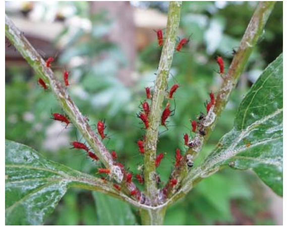
There are many control options for aphids.