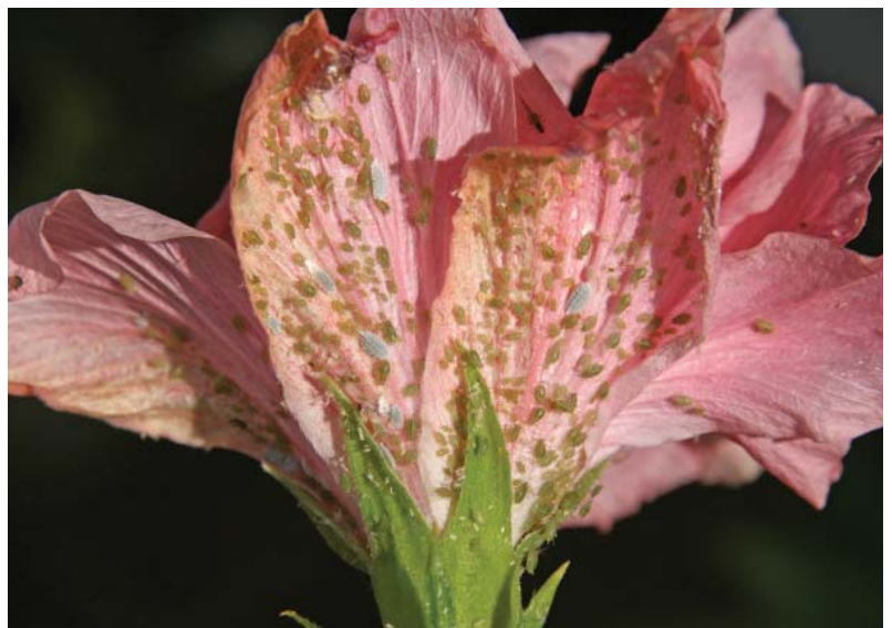
Hibiscus flower infested with aphids and a few mealybugs.

Only 25% of all plant species are infested with aphids; the aster or sunflower family (Asteraceae), conifers, and the rose family (Rosaceae) support the highest number of aphid species. Most species of aphids are monophagous or feed on just a few species of closely related plants. About 10% of aphid species, however, have a primary woody host where they spend autumn, winter and spring and an unrelated, secondary herbaceous host plant for the summer. For example, the rosy apple aphid has apple as its primary host and plantain ( Plantago lanceolata ) as its secondary host. Only a few species have a wide range of secondary hosts, but these tend to be important pests, such as the green peach aphid.