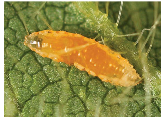
Orange larva of Aphidoletes aphidomyza .

Brown lacewings (Hemerobiidae) – are similar to green lacewings, but tend to be smaller, the adults are brown and the eggs are not stalked. They are frequently found in trees.