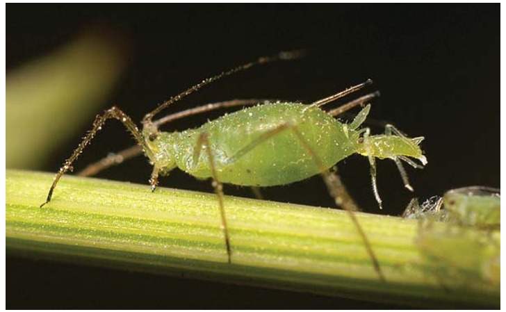
A female aphid gives birth to a nymph.

offspring within a week when temperatures are high. Eggs within these females start to develop long before birth so that a newly born aphid can contain within herself not only the developing embryos of her daughters but also those of her granddaughters which are developing within her daughters. This “telescoping of generations” means aphids can build up immense populations very quickly. Under ideal conditions, one aphid could theoretically produce billions of offspring by the end of a growing season. Obviously this doesn’t happen, since natural controls – such as weather and predators – eliminate significant numbers of aphids.