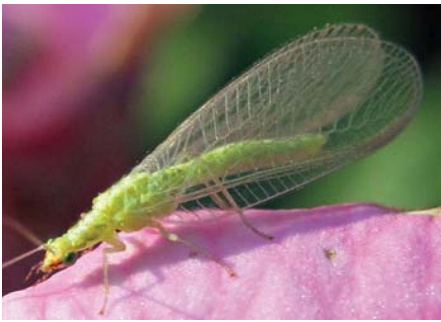
An adult green lacewing, close-up.

Green lacewings (Chrysopidae) – are voracious aphid predators as larvae; only a few species feed as adults. Chrysoperla carnea and other species are available to purchase for release, as well as occurring naturally.