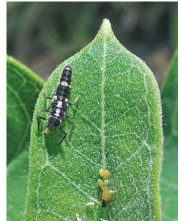
A lady beetle larva eats an oleander aphid.

Pathogens – several fungi, including Beauveria bassiana , Paecilomyces fumosoroseus , and Verticillium lecanii , will infect and kill aphids.