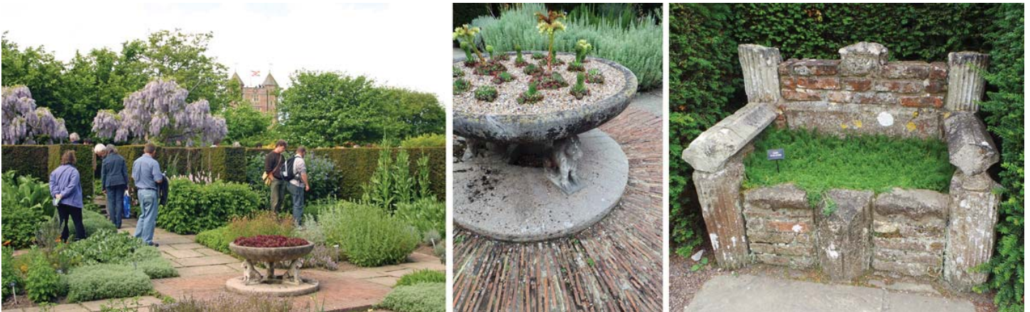
The Herb Garden in spring (L). The marble bowl filled with Sempervivums is supported by stone lions sitting on an old millstone (C), while the “chamomile seat” is along one of the walls of yews (R).

The small, rectangular formal herb garden with its medicinal and aromatic plants is enclosed by buttressed yews. A mixture of over a hundred varieties of herbs and useful flowers makes the Herb Garden colorful as well as aromatic. The paths were originally creeping thyme over concrete slabs and grass, but had to be replaced with brick and stone because of damage from foot traffic. The shallow marble bowl – filled with Sempervivums – in the middle was bought by Vita and Harold in Istanbul, where it stood on its tripod of little lions in their sitting room when they lived there for a year. It sits on an old millstone on a slightly raised bed of bricks fanning out from the center. The “chamomile seat” was created by their chauffeur, Jack Cooper, from pieces of stone from the ruins of Sissinghurst Castle, something that was very popular in medieval gardens.