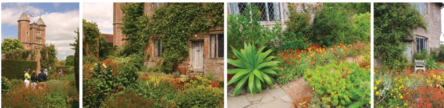
In the Cottage Garden, looking back at the Tower (L), the South Cottage with the white rose, 'Madame Alfred Carrière' (not in bloom) on the wall (LC), and colorful flowers in front of the Cottage in late summer (RC and R).

The Cottage Garden was intended to be a private family garden, next to the South Cottage where Vita and Harold lived. It was the first garden they planted; on the day they bought Sissinghurst, they planted a white rose, 'Madame Alfred Carrière', against the cottage wall. It still survives, climbing up the building, above the door and windows.