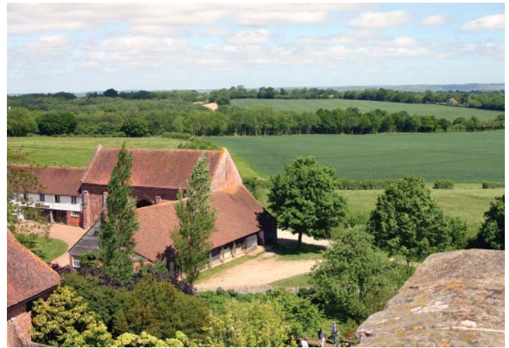
Old farm buildings and countryside beyond in spring.

It took three years of thinking, planning, and cleaning up the piles of junk left behind by former occupants before they really started creating the gardens. During this time they discovered the moat wall of the medieval manor house and created a lake to the south by damming a stream that filled two marshy areas. Eventually English yew ( Taxus baccata ) hedges were planted, but it took many years for the slow-growing plants to get large enough to fit the intended design. Limited funds also constrained the development of the gardens to a certain extent.