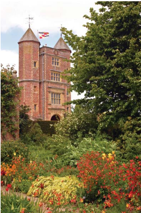
The Tower from the Cottage Garden.

the South Cottage; the kitchen, dining room and boy's rooms were in the Priest's House; and the entry range's stables were transformed into the Library, or family room, where a TV was installed in 1939. The garden next to the Priest's House was used as a dining room whenever the weather permitted; the courtyard was their entry hall; and the tower was Vita's private work space.