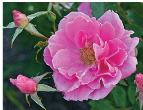
Roses were one of Vita's favorite flowers.

The Rose Garden is in the walled space that was once the garden of the Tudor manor. The yew hedges forming the Rondel – enclosing a round patch of grass in the middle and with gaps in