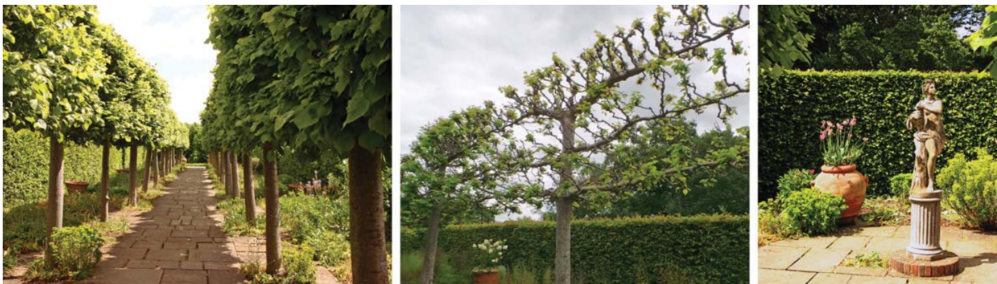
Pleached linden trees line the Lime Walk (L), which is pruned in every summer to maintain their shape (C). A statue terminates the Walk's vista (R).

The Lime Walk is at its peak in spring when spring-flowering bulbs are in bloom, before the pleached limes ( Tilia sp., with the common name of linden in North America) leaf out. (The trunks are kept free of branches to about 7 feet, then three rows of branches are trained on three horizontal wires, creating, in effect, a narrow hedge on stilts.) The trees are clipped each year to maintain their shape. In the summer impatiens planted in the terracotta pots, imported from Siena, Italy in 1965, provide some color, but the planting of bulbs is too dense to accommodate any other plants in the ground. Hornbeam hedges separate this area from the Rose Garden and open pastures to the south. A statue of a Bacchante terminates both the Lime Walk's vista and the vista through the Rose Garden's Rondel. Stone has replaced the concrete pavers Harold was forced to use.