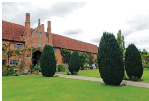
Irish yews along the path in the entry courtyard.

The entry courtyard was difficult to design because the arches of the entry range and tower are not directly opposite each other; the building angles inward, so the north and south walls are different lengths (see the map, above); and the two buildings are at different levels. Instead of paving the entire courtyard (which they couldn't afford), the ground was graded and a path installed between the broad lawn and beds along the perimeter. The paved path, flanked by topiary Irish yew trees (which Vita preferred left as shaggy pillars), leads to the tower.