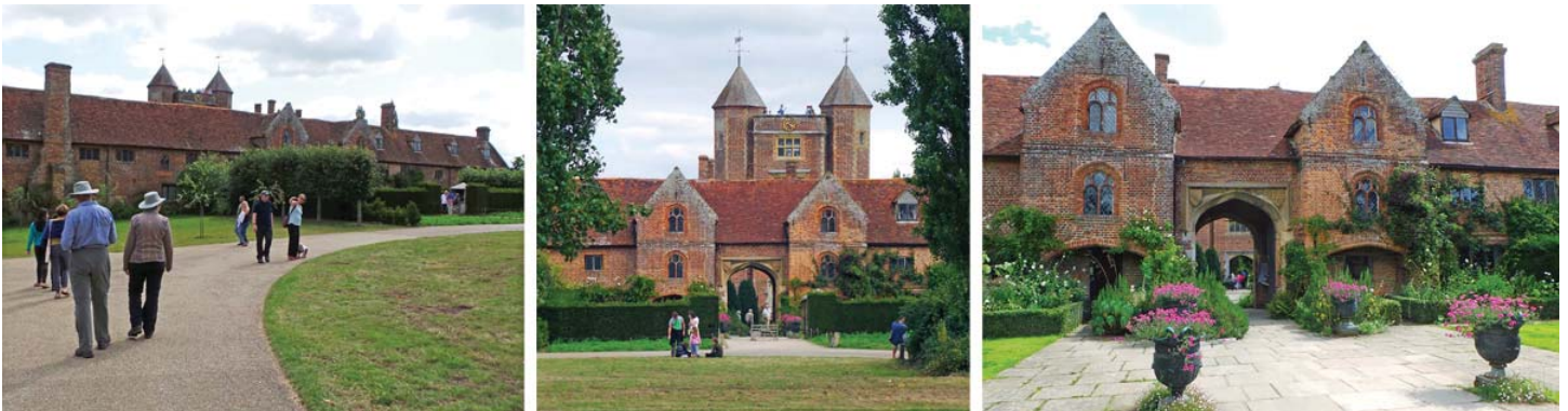
Walking toward the entrance to the gardens at Sissinghurst (L), the tower and service range (C) and the entrance archway through the service range.

The entrance is the largest and oldest part of the surviving building dating from about 1490. It was originally the service range, with stables on one side of the archway and lodging for servants on the other, and was one of the first big houses in Kent to be built of brick instead of stone and wood. When Vita and Harold bought the property, the archway was bricked up on both sides. One of their first improvements was to open it up. There are two strange alcoves, shaped like fireplaces flanking the entrance archway.