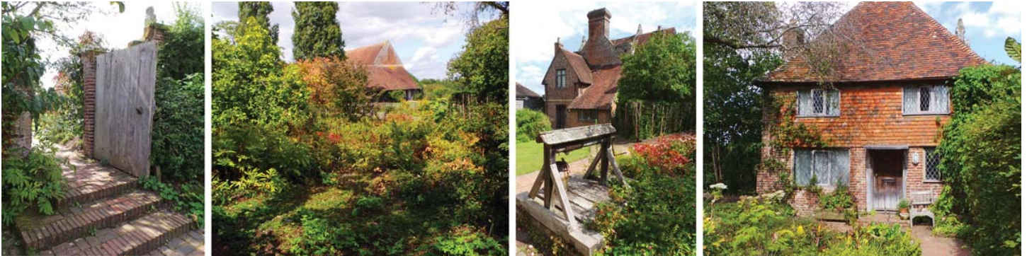
Brick steps lead into the Delos from the Courtyard Garden (L), a shady, informal garden (LC) adjacent to the Priest's House (RC and C).

This building was restored to house the kitchen and dining room and the gardens around it were some of the first to be created. The "Delos", to the south of the house, which was laid out in 1935 and planted with mainly earth tones, was named after the Greek altars that were once spaced along its path. Harold came up with the idea for this garden when he visited Delos, a Greek Island in the Aegean Sea in 1935. The area to the east was replanted in 1950 as the famous White Garden.