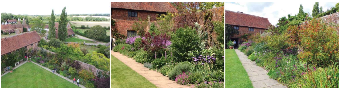
The purple border in the front courtyard from the tower (L), in spring (C) and in late summer (R).

Inside the courtyard, the bed along the north wall is planted with nothing but purple-flowering plants. This purple border was probably a deliberate response to Gertrude Jekyll's comment that purple was a difficult color in gardens and should be used sparingly. Vita combined numerous shades of magenta,