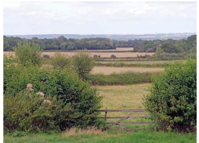
Countryside around Sissinghurst.

for another 100 years. Eventually the house was leased to the government and used as a prison camp for French prisoners during the Seven Years War. (It was these prisoners that gave the title 'castle' to the site, as the house was very similar to a French chateau.) The buildings were heavily damaged during this time, so at the end of the war many of them were demolished, leaving only the entrance range, the tower and a few of the outbuildings. Over the next 50 years the buildings were occupied by the poor who worked on the estate farm and nearby brickyard. When the large Victorian farmhouse was built in 1855, the old buildings were scarcely habitable. Sissinghurst Castle once again went up for sale in 1928. On a rainy day in April 1930 Vita Sackville-West came looking for an old house where she could make a new garden, fell in love with Sissinghurst Castle and she and her husband bought it, along with 400 acres of farmland. They made