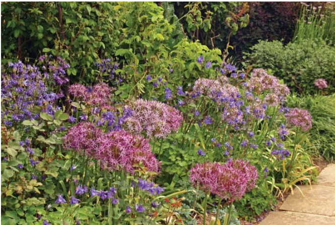
Alliums and columbines provide color in the Rose Garden in the spring.

The garden was first opened to the public in 1938, while Vita and Harold were still living there. When Vita died in 1962, Harold and her two sons transferred ownership to the National Trust to preserve the garden (completed in April 1967). Now it is enjoyed every summer by thousands of visitors from around the world. The National Trust has tried to maintain Sissinghurst looking the way that it did when Vita lived there, but some flowers and trees have had to be removed or replaced due to age or disease; additional flowers were added to the rose garden (which was intended to be filled with roses during June but little else for the rest of the growing season) that bloom before and after the roses bloom, changing the feel of