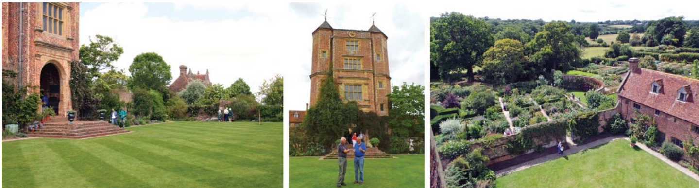
The Tower Lawn (L), looking up from the lawn at the Tower (C), and view of the front courtyard and Rose Garden from the top of the Tower.

for the main axes, and providing a “rest” from the other intensely planted areas. This is the open area from which visitors can appreciate the lines of the garden. At the top of the tower, the view includes not only the 12 acres of garden, but also the Weald up to the North Downs 12 miles away and the woods, lakes and oast-houses of the Sissinghurst estate. This is the only place to see the garden in its entirety. Looking down from the flat roof of the tower between the turrets, the layout of the gardens is quite clear.