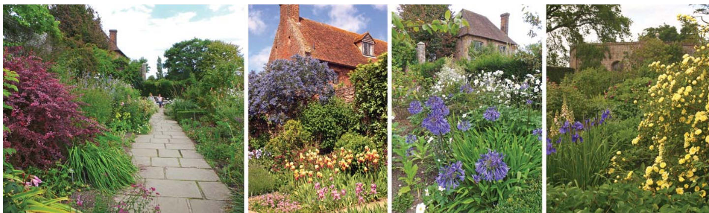
Paved paths and many other shrubs and perennials were added (L), including lilac and bearded iris (LC), blue agapanthus and white anemones (RC), and foxglove, iris and peonies along with this yellow rose (R).

Vita's original intent was to have mainly a shrub rose border, not an herbaceous border. Peonies and bearded iris were integrated with the old roses to bloom earlier, and clematis, a few lilies and Japanese anemones flowered later, but she generally wasn't in residence in late summer, so had no need to have this garden colorful all summer. After taking responsibility for the garden, the National Trust added many more perennials so the garden would be attractive in late summer. Another change was to pave the mown grass paths through the Rose Garden since the grass couldn't stand up to the heavy traffic of visitors; Vita might have had this done earlier had they been able to afford to.