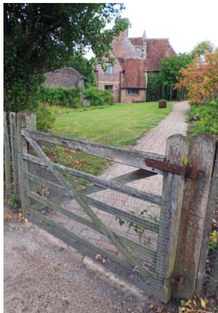
Side entrance to Priest's House.

The site, whose name derives from a Saxon clearing in the woods, has been settled since the late 12th century. During the early middle ages a stone manor house surrounded by a moat (of which three arms remain) was built. After the property was purchased by the Baker family in the 1400's, the old medieval manor house was demolished and replaced with a grand mansion. The Elizabethan manor house, based on a double courtyard, and tower were built by Sir Richard Baker during 1560-70. The imposing archway and Gatehouse were added