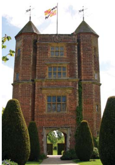
The tall tower of pale pink brick at Sissinghurst Castle Garden.