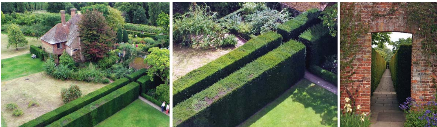
The Yew Walk, along the back of the Tower lawn with the South Cottage beyond (L), the sheared yew hedges from the tower (C), and as seen from the Rose Garden (R).

The long yew walk is nothing more than two narrow green hedges enclosing the paved pathway, but when viewed from the opening from the Rose Garden or White Garden, a sense of distance is created in a fairly confined space. The hedges also separate the Tower Lawn and Orchard and are one of two central axes of the gardens. The yews weren't spaced far enough apart to allow for their growth when they got older, so the path isn't wide enough for two people to walk side by side on the path – one of the few flaws in the gardens' design.