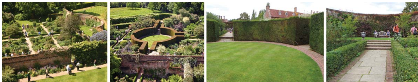
The east end of the Rose Garden from the Tower (L), the Rondel from the Tower (LC), inside the Rondel (RC), and the focal point of the curved wall at the east end (R).

each quadrant leading to formal beds outlined in boxwood – were planted in 1932. Like the courtyard, the Rose Garden is not a perfect rectangle, so dividing the space with the Rondel obscures the imperfection. It was offset from the absolute center so it would line up with a doorway of the old Tudor manor, making the western part of this garden larger than the eastern part. The tall hedges block views from inside the Rondel into the Rose Garden, instead directing attention to a focal point at the end of each walk. The curved wall at the east end reflects mimics the design of the best Italian gardens of the 16th and 17th centuries. By late summer the wall is covered with purple-flowered clematis. At one time 12 old crabapple trees lined the central walkway, but they were removed in the 1960's. They were later replaced with serviceberry ( Amalanchier ) trees.