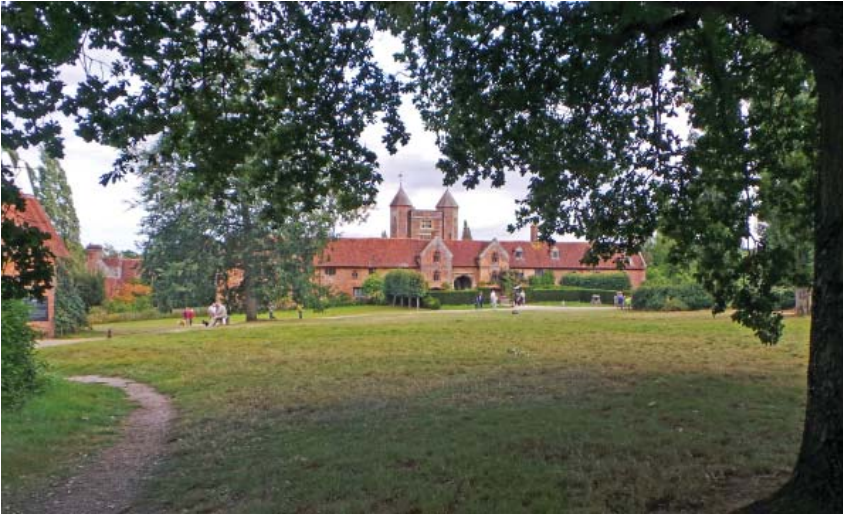
Sissinghurst Castle Garden.

which captivated Vita when she first saw Sissinghurst; she wrote some 20 books in the Tower room and it remained her refuge until her death at age 70.