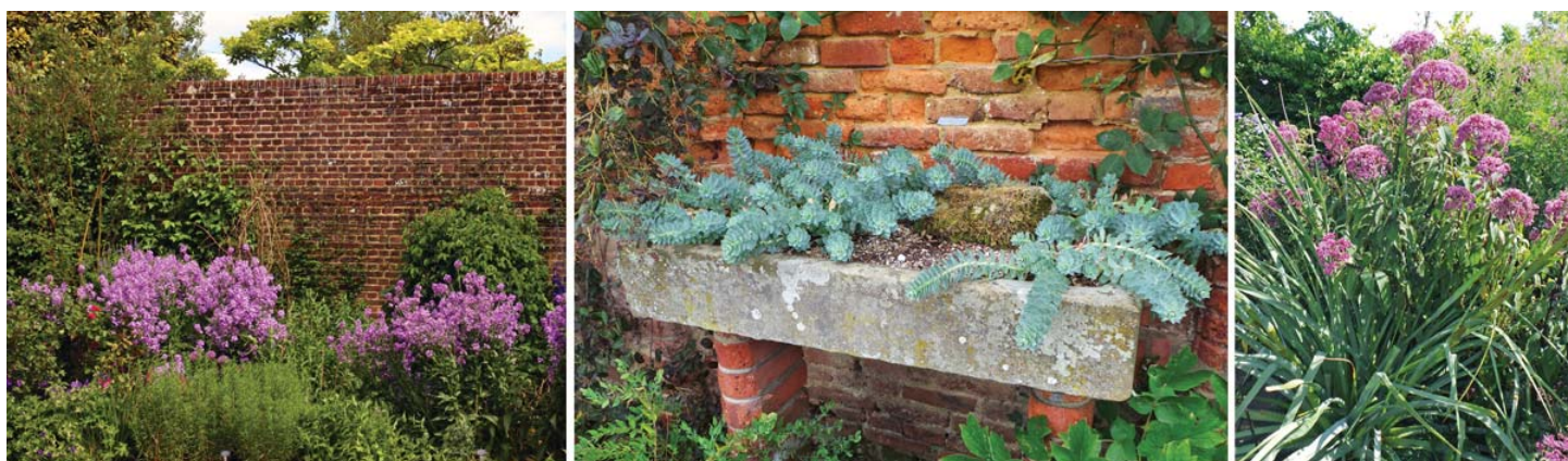
Dame's rocket in the purple border (L), Euphorbia myrsinities growing in a stone sink (C), and Joe-pye weed (R).

mauve, lavender, and purple to create a rich, monochromatic tapestry. This border looks best on a cloudy day, as the flowers are a bit dull in the sunshine, but imagining it as an old tapestry hanging against the wall of a grand hall, makes it very effective. The purple border is the showpiece of the courtyard, but Vita loved roses and clematis, so they were used here, too. Red ('Allen Chandler') and pale pink ('Meg') roses climb up the old brick walls around the archway and toward the dormer windows, and clematis and other vines cover other parts of the house and walls. A number of stone sinks dating from the 19 century were salvaged from the junk left on the property and used to grow alpine plants. Other colors sneak into the beds around the rest of the perimeter of the lawn. Some plants we would consider weeds are included in this garden, including the purple form of Dame's Rocket ( Hesperis matronalis ) and purple loosestrife ( Lythrum salicaria ) that blooms later in the season.