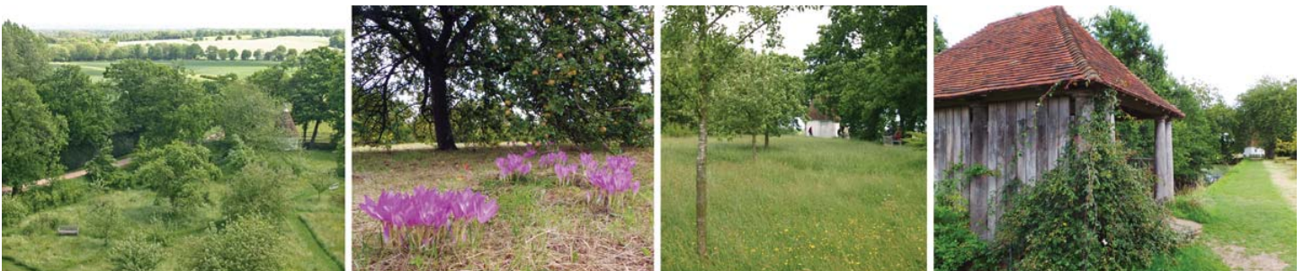
The orchard from the Tower (L), autumn crocus in bloom under apple trees (LC), the unmown meadow in spring with the gazebo beyond (RC), the Boathouse is at one corner with the gazebo at the far end (R).

The orchard sits between the two water-filled arms of the moat in the place where the old medieval manorhouse once stood. In the spring the area is filled with white and yellow daffodils, so the grass is not mowed until much later in the season, after the bulb foliage has died down. This gives a rather wild, unkempt look to the place for while. Mown paths through this temporary meadow lead to the small, octagonal gazebo at the junction of the two arms of the moat. The gazebo was built in 1969 by Nigel and Benedict Nicolson as a memorial to their father, Harold, and was used as a private summer office with windows looking out onto the countryside rather than the garden. The rustic Boathouse is at the corner of the orchard nearest the White Garden.