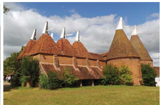
The Plant Shop (L), Visitor Reception (C), and the oast houses converted to house exhibitions (R).