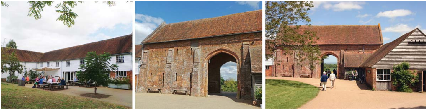
The granary now houses the restaurant (L), the Elizabethan barn (C) and gift shop in building by barn (R).

The adjacent Elizabethan barn reflects the importance of the farm surrounding the castle and gardens, while the former granary is now a restaurant serving hungry visitors. The gift shop is in the old farm building next to the barn.