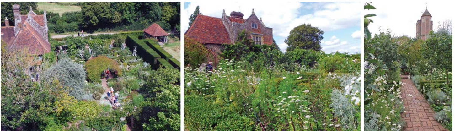
The White Garden from the Tower, with the Priest's house at left and enclosed by yew hedges (L). The garden has only plants with white flowers and silver foliage (C). A path through the White Garden with the Tower beyond (R).

This garden is probably the most famous of the separate gardens at Sissinghurst. It was started in 1950 by replanting the garden to the east of the Priest's House, retaining the original layout but fusing a color scheme of silver and white: focusing on plants with gray or white foliage and flowers of mainly white, but with touches of yellow. It is unclear what inspired Vita to create this monochromatic garden. Through her writings we know she had been thinking about creating a white garden for at least a decade. Although other white gardens in England (such as the phlox garden at Hidcote) predated this one, they did not seem to have an influence on the development of the White Garden at Sissinghurst. Some speculate that she was inspired by descriptions of white gardens from hundreds of years earlier in Moghul India.