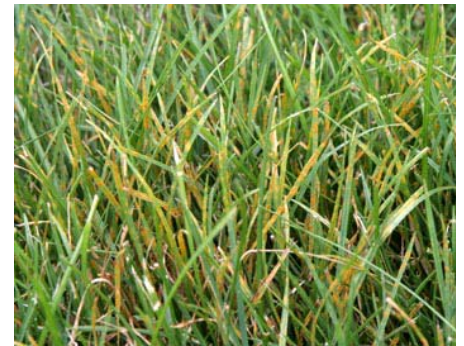
Infected areas of lawn take on a yellow-orange cast.

Turf rust is easily identified by the orange pustules on the surface of the leaves. Infected areas of lawn take on a generally yellow appearance with an orangey cast. Initial sites of infection on leaves are light yellow flecks that soon enlarge to form round to elongated pustules that rupture through the grass epidermis to release the powdery spores. Depending on the species, the spores may be red-brown, brownish yellow, bright orange or yellow.