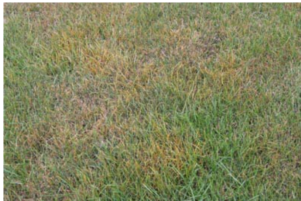
An area of turf infested with rust has a yellowish appearance.

This disease can be reduced by proper fertilization, mowing and irrigation. If you can keep the turfgrass growing vigorously, it will be mowed before spores can be produced. Maintain good vigor through optimum fertilizer applications (based on soil test results) and mow regularly at the height recommended for the type of grass you have. Collect and dispose of infected clippings if possible. Water established lawns deeply and infrequently during periods of drought to keep the grass growing. Try to water early in the day so the lawn will dry out and not have water remaining on the leaf surface for long periods of time, which increases the chances of infection by rust as well as many other diseases. Fungicide applications are generally not recommended for homeowners unless the lawn has been severely infected for several years in a row. The infection eventually disappears when the weather turns cold.