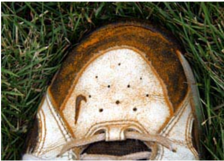
Orange dust on shoes means the grass is infected with rust.

Have your shoes turned rusty-orange after walking across the lawn? If so, your lawn is affected by a fungal disease called rust. Rust may appear at any time during the growing season, but is most common during late summer and autumn and is often more severe in shaded areas. It appears during warm, humid, dry periods when the grass is growing slowly or not at all, and nights are cool with heavy dews. Rust is most common on Kentucky bluegrass and perennial ryegrass lawns.