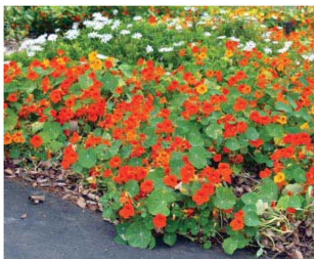
Nasturtium flowers are edible.

Nasturtium flowers and leaves are edible and make an attractive addition to salads. They have a slightly