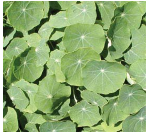
Nasturtium has nearly circular leaves.

The peltate (shield-shaped) or nearly circular, deep green leaves have light-colored veins radiating from the central petiole. Leaves can be quite large, up to 4' across on some plants. Many types have flat, round leaves reminiscent of water lily pads. There are some cultivars that have variegated, almost speckled, leaves. Depending on the variety, the plant either forms a low mound or trails up to 3 feet.