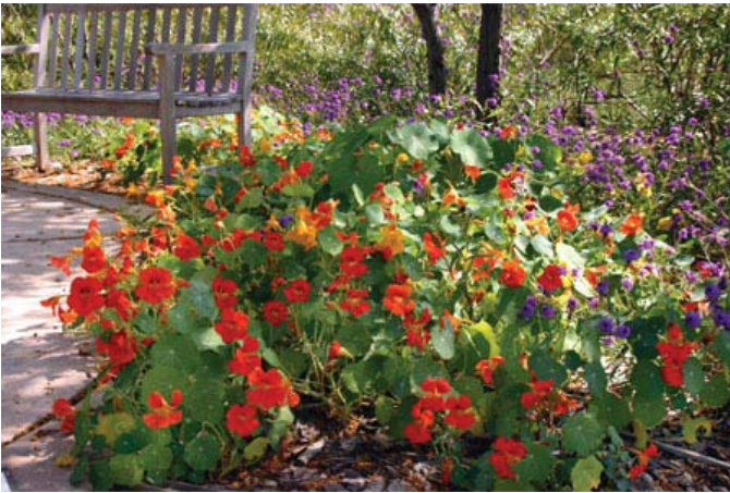
Nasturtium is an easy-to-grow annual.

Nasturtium is an easy-to-grow, warm-season annual (perennial in zones 9 -11) with distinctive leaves and brightly colored flowers. Nasturtium is the common name of Tropaeolum majus . It is one species in a genus of about 80 species of annual and perennial herbaceous flowering plants in the family Tropaeolaceae native to South America and Central America, from Mexico to Chile. This common name refers to the fact that it has a mustard oil similar to that produced by watercress ( Nasturtium officinale , family Brassicaceae). Early English herbalists referred to nasturtiums as “Indian cress” after the conquistadors discovered them in the jungles of Peru and Mexico and brought them back to Spain in the 16th century.