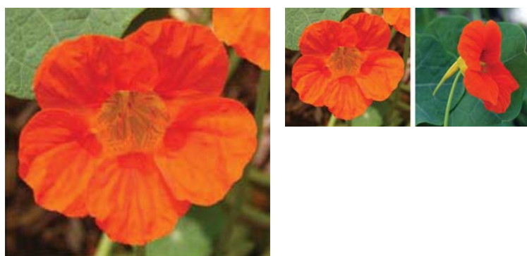
Nasturtium has intensely colored flowers, with a spur on the back.

The intensely colored flowers traditionally were bright yellow and orange, but now the flowers come in many different shades of red, yellow, orange, and cream in both rich, saturated jewel-toned colors and more muted pastels. Most are a single color, but some varieties are lightly marked with a second color towards the center. They normally have five petals and always have a funnel-shaped