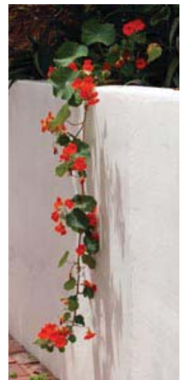
Trailing varieties look good cascading down walls.

nectar spur in the back. The flowers spread to more than 2½" wide. The plants produce 3-segmented fruit, each portion with a single large seed. Plants will self-seed readily. In warm climates it blooms and seeds all year round, and is considered invasive in many of those areas.