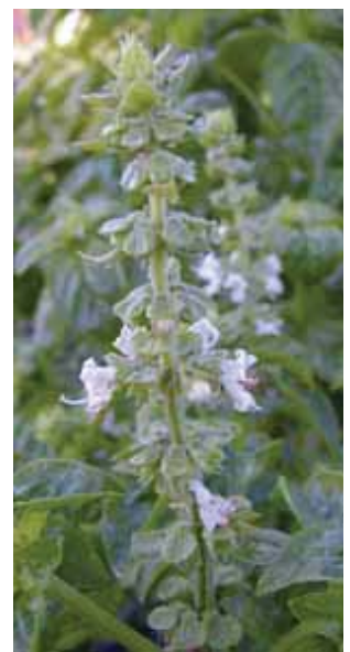
Basil produces spikes of white or pink flowers.

Basil is generally easy to grow, but may be attacked by common garden pests such as spider mites (especially when hot and dry), aphids, Japanese beetles, or other insects. These can be controlled by hosing off the plants or applying insecticidal soap, or removing the beetles by hand. A few generalist fungal or bacterial diseases may occasionally affect individual plants. Root rots (or damping off of seedlings) occur primarily when the soil is too wet.