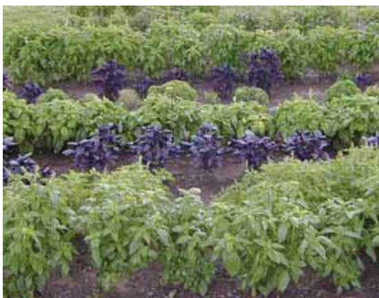
Basil is easily grown from seed.

Basil is easily grown from seed, or can be purchased as small potted plants. Plant seeds early in spring, sowing the seed at a half an inch deep. They can be sown directly in the ground after all danger of frost has passed, or can be started indoors 4-6 weeks before setting out (use 2-3 seeds per pot) for earlier harvests. Germination can occur in 5 to 7 days, but will take longer under cool conditions. Place plants outside 12-15 inches apart.