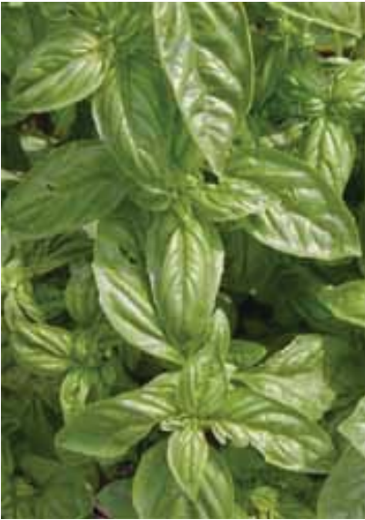
Basil: Herb of the Year 2003

The International Herb Society has designated basil as the Herb of the Year 2003. Sweet basil ( Ocimum basilicum ) is a sun-loving annual with highly aromatic leaves that has a pleasant spicy odor and taste somewhat like anise or cloves. Both the leaves and their essential oils are used as flavoring agents. There are many different types of sweet basil – large and dwarf forms, with green, purple, or variegated leaves. Many of these widely grown plants are ornamental, as well as edible.