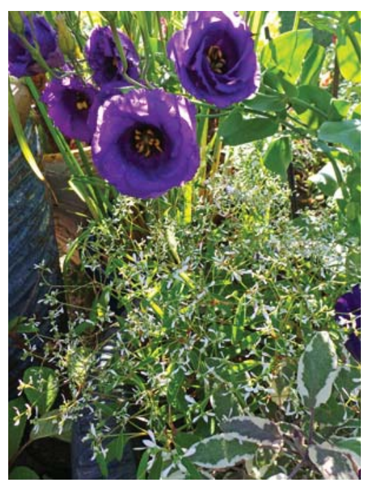
Euphorbia Diamond Frost® with purple lisianthus and tricolor sage.

Grow this bedding plant in full sun to part shade in any type of wellwill still look good despite a little abuse or neglect. It is heat- and drought-tolerant so does not require much watering (except those in containers), and is actually sensitive to overwatering. Deadheading is not necessary - faded flowers naturally fall off the plant, keeping it looking any time to encourage branching for a fuller appearance or to shape or keep their size in check. The sap can irritate sensitive skin so wear