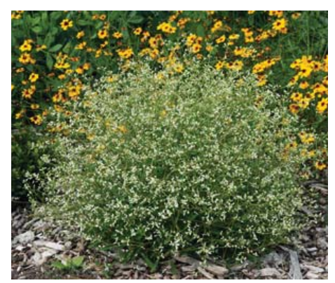
Euphorbia Diamond Frost® has a mounted habit.

Euphorbia with airy foliage and a profusion of tiny white flowers reminiscent of baby's breath. Usually listed E. hypericifolia, E. graminea, or a hybrid with one of those species