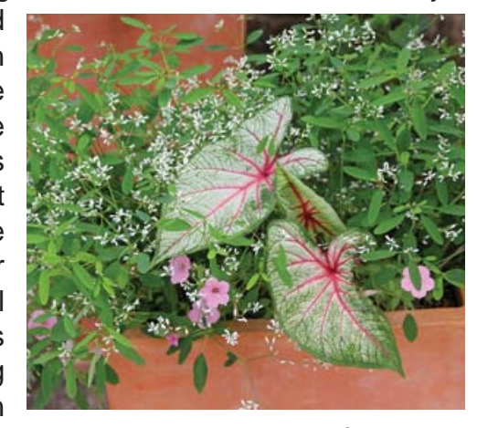
Euphorbia Diamond Frost® in a pot with caladium and petunias.

breath - makes it a good filler in mixed plantings. With a shallow, non-competitive root system they can be planted between perennials or around roses without adversely affecting those plants. In containers or hanging baskets it will spill over the edges, filling gaps between taller or trailing plants. It can also be grown as a houseplant to bloom