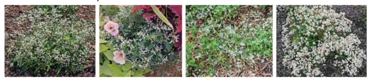
Other cultivars: Breathless<sup>™</sup> White (L), 'Hip Hop' (LC), 'White Manaus' (RC), and Diamond Delight<sup>™</sup> (R).

In addition to Diamond Frost® there are several other varieties (Breathless™ White, 'Hip Hop', 'White Manaus', etc.) with green leaves and white flowers that the average person would be hard pressed to tell apart from each other. White Manaus' is supposedly larger, more vigorous, and with brighter green foliage than Diamond Frost®, but this is not readily apparent unless grown side by side. Breathless™ Blush (='Balbreblus') is a more compact (less airy) variety with burgundy tinged leaves and pink-flushed white flowers. 'Silver Fog' supposedly has silvery foliage. Diamond Delight™ looks noticeably different, however — it is much shorter and mounding, and has double flowers it doesn't have the same, so it doesn't have the same airy look and effect as Diamond Frost®.