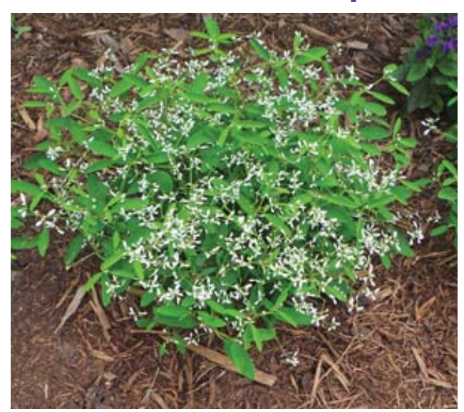
Euphorbia Diamond Frost®

Chamaesyce hypericifolia after a recent reclassification), the cultivar 'Inneuphdia' (or sometimes spelled 'Inneuphe') is commonly sold under the trade name of Diamond Frost®.