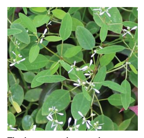
The leaves are long and narrow.

This tender perennial (hardy in zones 10-12, and root hardy in colder areas with protection) is grown as an annual in most places. Plants grow 12-20 inches tall with a mounding growth habit. The upright stems have widely spaced, narrow, gray-green to bright green leaves.