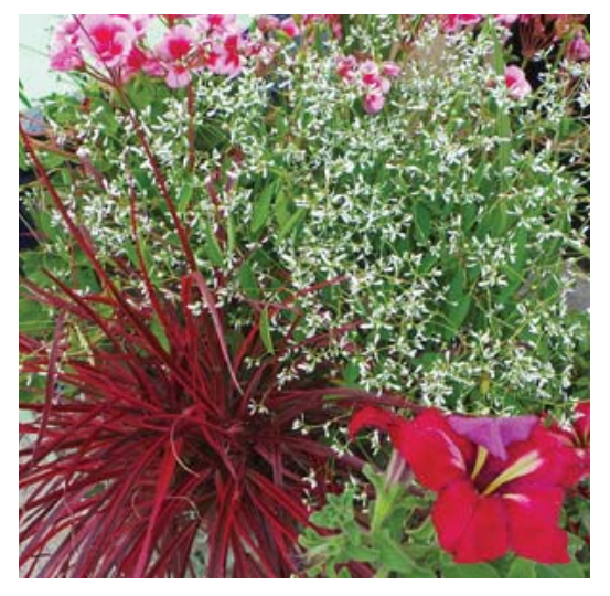
Euphorbia Diamond Frost® fills between other plants in a container.