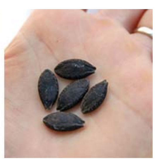
The mature fruits (L) dry out (C) and expell the dark brown or black seeds (R).

Wild cucumber can be cultivated as an ornamental annual vine, and would be great for covering arbors and pergolas, or for rambling horizontally along fences, walls and other low structures. It does best in