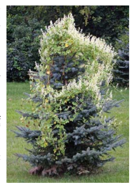
Wild cucumber is an aggressive vine that can nearly smother small trees.