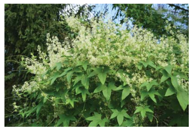
Wild cucumber in full flower.

Starting in mid-summer the vines begin to produce fragrant, pale yellowish-white flowers. The plants are monoecious (separate male and female flowers are produced on the same plant) and the flowers are pollinated by insects. The numerous male flowers form in clusters on a long, erect raceme from the leaf axils. Each ½ - ¾ inch wide flower has 6 long, thin petals, giving a star-like appearance. The filaments of the three stamens form a column, with the yellow anthers on the end. The female flowers occur singly or in pairs interspersed among the male flowers, with a small, rounded spiny ovary below the yellow-green petals.