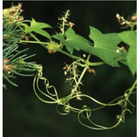
The palmate leaves are deeply lobed. Curling tendrils arise from leaf axils. A seedling wild cucumber.