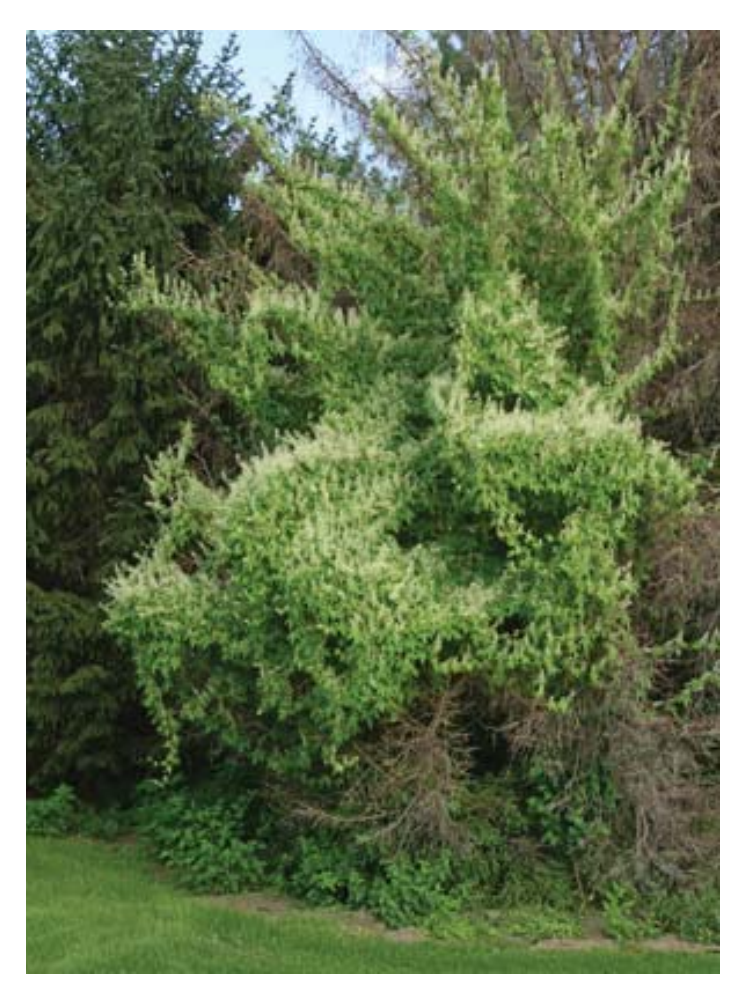
Flowering wild cucumber covering a dead spruce tree.

In late summer you may notice trees or shrubs festooned with crowns of white flowers that obviously are not the woody plant blooming. Look closely and you'll notice the leaves and individual flowers look just like that of cucumber - this is wild cucumber or balsam-apple, Echinocystis lobata . The name Echinocystis comes from the Greek echinos for "hedgehog" and cystis for "bladder", appropriately describing the spiny fruit.