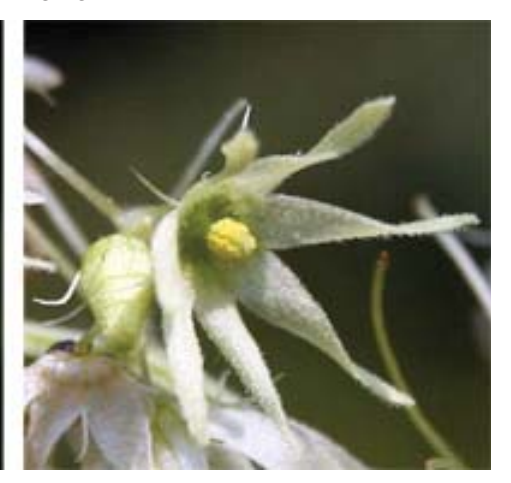
The male flowers are produced in large racemes (L), with each flower having 6 long, thin petals (R).

Superficially the fruit resembles a small and rounded cultivated cucumber, but with prickles all over it. The puffy, spherical to oblong, green pods with long, soft spines grow up to two inches long. Despite the common name, the fruits are not edible, and can cause burning reactions in some people. The pods can be used in dried flower arrangements.