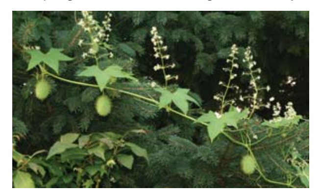
Wild cucumber can look like strings of green plant, it is generally Chinese lanterns hanging in a tree. plant, it is generally considered a weed

Wild cucumber can be cultivated as an ornamental annual vine, and would be great for covering arbors and pergolas, or for rambling horizontally along fences, walls and other low structures. It does best in