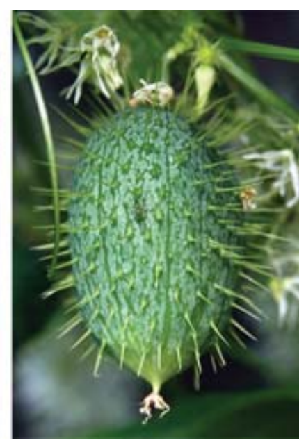
Female flowers have a prickly ovary beneath the petals, which quickly devlops into the spiny fruit.