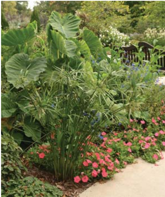
Papyrus can be grown as an annual in the Midwest. It grows over the small aquatic plants in the water garden.

A shorter form than the species is normally available as an ornamental. This is variously labeled as variety 'Dwarf Form', 'Nanus', 'Tutankhamun' or King Tut®. It grows only 2-3 feet tall, grows vigorously in or out of water, and is more shade tolerant than the species.