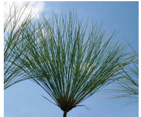
Each stem is topped with feather-duster-like growth.

Papyrus is a sedge (family Cyperaceae) – one of about 600 species in the genus Cyperus – that is probably best known as the source of ancient paper called papyrus. C. papyrus , also called Egyptian reed or paper reed, is a clump-forming African species hardy in zones 9-12. It is native throughout the wetter parts of Africa, Madagascar and around the southern Mediterranean where it occurs in vast stands in swamps, shallow lakes, and along stream banks throughout the wetter parts of Africa. The large, dense populations often line bodies of water. In ancient times it was widely cultivated in the Nile Delta, but now is nearly extinct there. The starchy rhizomes and culms are edible, both raw and cooked, and the buoyant stems were used for making small boats. Upright stems