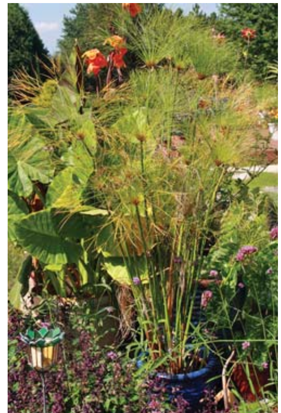
Use papyrus in or near water gardens.

in order to regulate moisture levels more easily. This plant can be potted in a container without drainage holes. Because of its vigorous growth it can quickly become potbound. Cut off old culms that have browned heads with a sharp knife or pruning shears close to the rhizome. This plant can be fertilized heavily. Propagate by division of the rhizomes in spring.