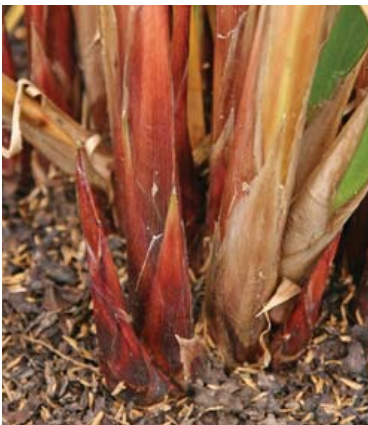
New shoots at the plant base.

gives this species a tiered effect that is quite ornamental.