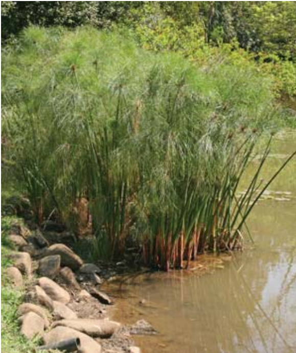
Papyrus is a sedge that naturally grows in shallow water and wet soils.

Papyrus is a sedge (family Cyperaceae) – one of about 600 species in the genus Cyperus – that is probably best known as the source of ancient paper called papyrus. C. papyrus , also called Egyptian reed or paper reed, is a clump-forming African species hardy in zones 9-12. It is native throughout the wetter parts of Africa, Madagascar and around the southern Mediterranean where it occurs in vast stands in swamps, shallow lakes, and along stream banks throughout the wetter parts of Africa. The large, dense populations often line bodies of water. In ancient times it was widely cultivated in the Nile Delta, but now is nearly extinct there. The starchy rhizomes and culms are edible, both raw and cooked, and the buoyant stems were used for making small boats. Upright stems