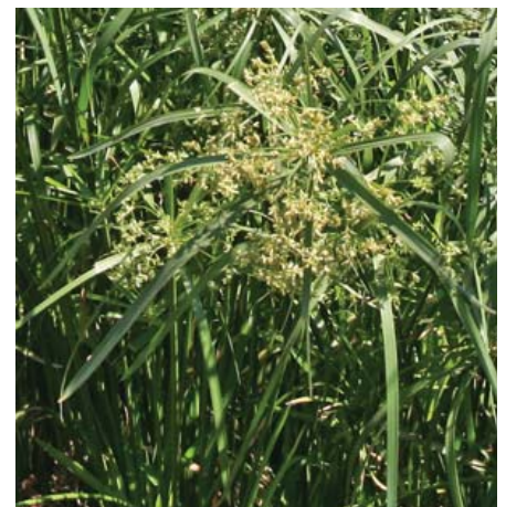
The non-descript, greenish-brown flowers are wind pollinated.

3-5 rays and narrow, elongated bracts are produced on the ends of the rays. The non-descript, greenish-brown flowers that are produced at the ends are wind pollinated. Eventually brown, nut-like fruits are produced. The mature fruits are dispersed in water after they fall from the plant. This terminal growth, subtended by papery brown bracts, resembles a feather duster at first and will eventually grow to 4-12 inches across. They may become so large that they bend over under their own weight as the cluster becomes almost spherical in shape. These are often used by birds, especially the social species, as nesting sites in its native habitat.