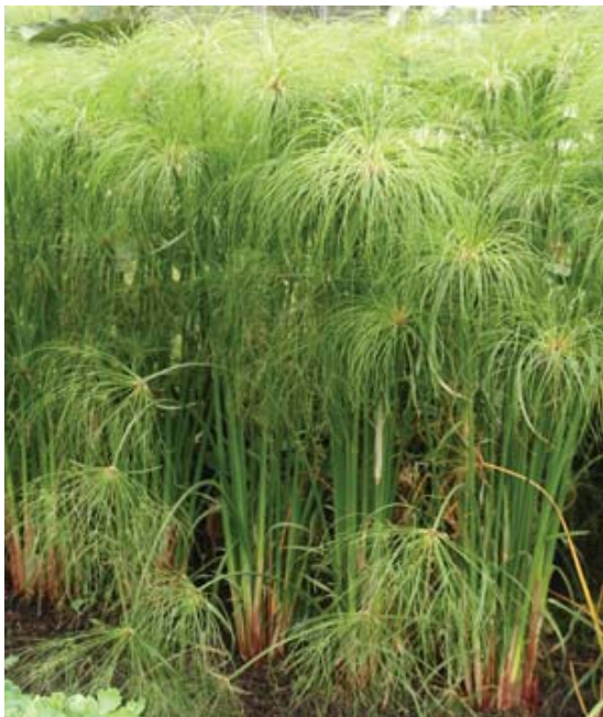
Papyrus adds a tropical feel to sunny areas.

This is an easily grown plant, but needs warm temperatures to thrive. It does best in full sun when grown as an annual in the Midwest. Plant in moist to wet soil or cultivate in a container