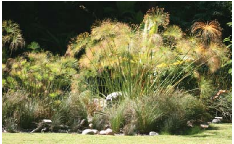
Papyrus is a tropical plant, so must be protected from frost.

Because it is of tropical origin, this plant is sensitive to frost, and should be protected or moved indoors when temperatures are below 40°F. Plants can be kept over the winter as long as the rhizomes are protected from freezing. It will survive – but not thrive – in a bright spot indoors or in a greenhouse over the winter if kept very moist, preferably in standing water (i.e. placing the container in a deep saucer filled with 1-2 inches of water). It may become essentially dormant, but will resume growth with new culms quickly replacing the old, weathered ones in the spring when the weather warms.