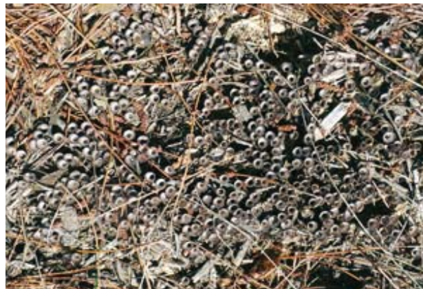
A large cluster of fluted bird's nest fungi growing on bark mulch.

promote their development, but they can be seen anytime conditions are appropriate. Even though each individual is small and inconspicuous, this species often grows in huge clusters, making them more noticeable – although they blend in so well with their background that it is very easy to overlook them.