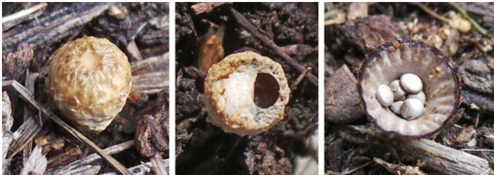
A young, closed fruiting body (L); one with the epiphragm starting to degrade (C); and one fully open exposing the peridioles (R).