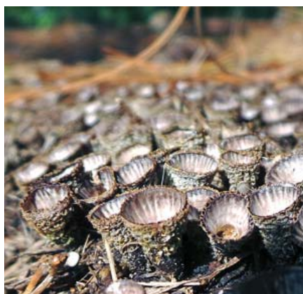
The vase-shaped body acts as a splash cup.

There are many fungi in several genera called bird's nest fungi because of the resemblance of their fruiting bodies to a tiny nest filled with eggs. One of the most common in Wisconsin is Cyathus striatus , the fluted bird's nest fungus. This species is widespread throughout temperate regions of the world, developing on dead wood in open forests, typically growing individually or in clusters on small twigs and fallen branches or other wood debris. Because it also grows readily in bark or wood mulch, it is frequently found in landscaped yards and gardens. Other species grow on plant remains or cow or horse dung. C. striatus , and others, are most commonly seen in the autumn when damp conditions