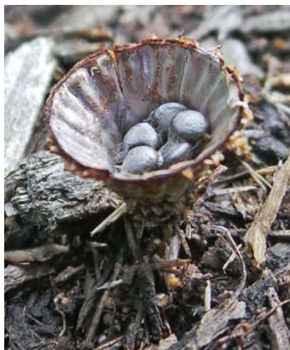
The fruiting body is a cup-shaped "nest" filled with "eggs".