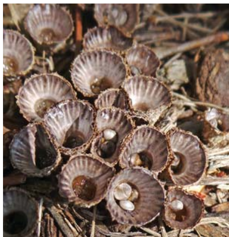
Fruiting bodies of fluted bird's nest fungus, Cyathus striatus .