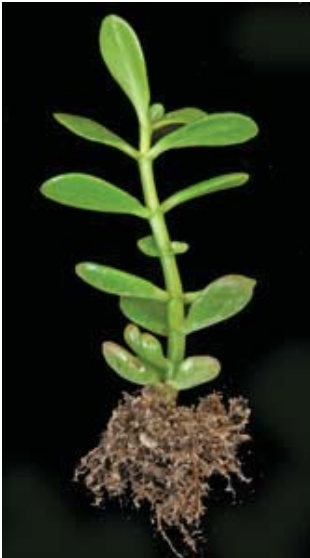
A rooted cutting.

Jade plant is especially easy to propagate from stem or leaf cuttings. In the wild or when planted outdoors in mild climates, leaves or pieces of plant that break off and fall to the ground will root in a few weeks. When taking cuttings, it is best to allow the pieces to dry for a few days so the cut surface will be healed over and less likely to rot. Inserting the cut end into fairly dry, well-drained soil will speed rooting, although they will produce roots even out of soil. Cuttings root most easily in summer, but jade plant can be propagated at any time of the year. This plant can also be grown from seeds sown in spring or summer.