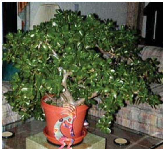
Jade plant is easily grown as a houseplant.

The plant has compact, rounded heads of pink flowers. The Khoi and other Africans used the roots for food, grated and cooked, eaten with thick milk. They also used the leaves for medicinal purposes.