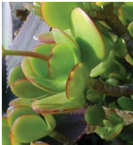
The rounded, fleshy leaves.

In its native habitat, C. ovata grows into a small rounded evergreen shrub (to 6 feet) on dry, rocky hillsides. It has many short, thick, succulent branches on a gnarled-looking trunk, suggesting great age even in young specimens. The bark peels from the trunk in horizontal brownish strips on old plants.