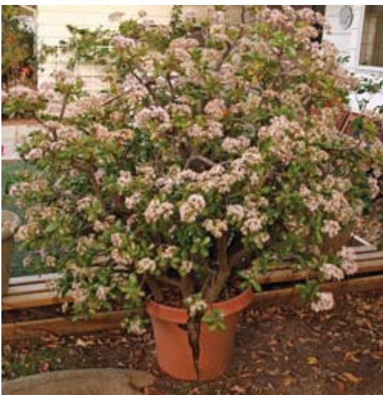
Plants can remain in containers for a long time, becoming root bound and top-heavy.

These plants need well-drained soil, and do best in potting mixes without peat or other moisture-retentive components. Use topsoil mixed with perlite, sharp sand, pea gravel and/or chicken grit to create a planting mix that will drain quickly. Individual plants can be grown for many years while root-bound, although it is best to repot them every two to three years or when a plant becomes top-heavy and susceptible to tipping over. The best time to repot is as new growth starts. Prune the roots when re-potting into the same size pot and cut back the stems to maintain the shape and encourage development of a thick main trunk. Water sparingly until established in the new container.