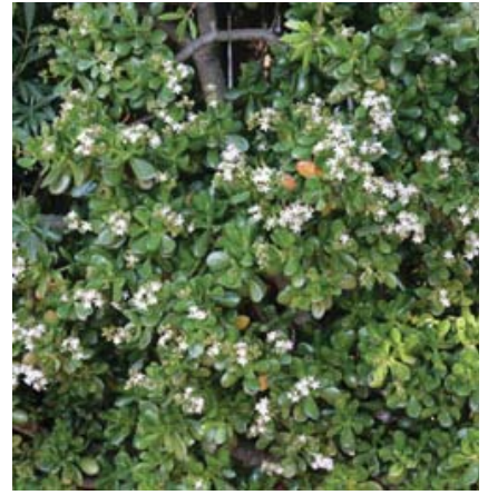
Foliage and flowers of jade plant.

Jade plants benefit from pruning to keep them compact and growing vigorously. This is best done in spring, cutting stems back to a lateral branch. Pruning encourages the trunk to develop to be able to support the weight of the heavy leaves and stems, and also encourages root growth. They can be pruned into miniature trees, and make an excellent choice for a succulent bonsai specimen or a wonderful sculptural plant. The cuts will heal over in a few days and new growth will sprout within a few weeks.