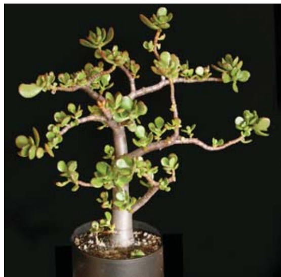
A bonsai-like jade plant.

Crassula ovata is a common houseplant that is usually called jade plant, or less frequently referred to as friendship plant, money plant, or silver dollar plant. Previously classified as C. argentea , C. portulaca and C. obliqua , it is still occasionally sold under these other, older (and incorrect) names. This species is just one of about 300 in a diverse genus, part of the orpine family (Crassulaceae), about half of which are native to southern Africa. The name crassula means thick or fat, referring to the fleshy nature of the genus, and ovata means egg-shaped, referring to the shape of the leaves of this species. C. ovata is a prominent component of valley thicket vegetation of the Eastern Cape and KwaZulu-Natal. The very similar C. arborescens , which has almost spherical blue-gray leaves with a distinct waxy bloom, is found in a different area, in the Little Karoo and Central Karoo. It has compact, rounded