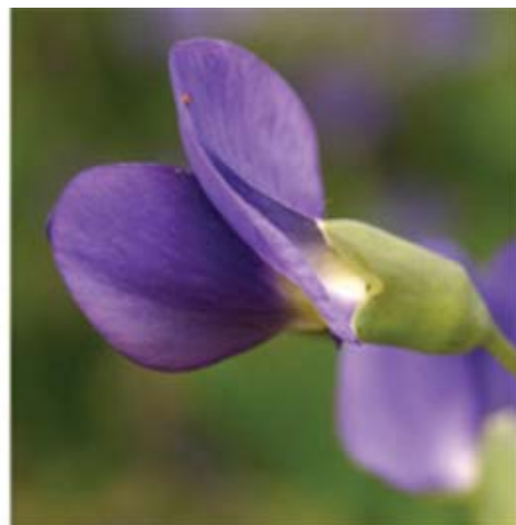
Flowers buds emerge in late spring, with the individual, pea-like flowers opening up the spire.