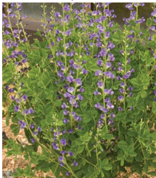
Flowers are a purplish-blue.

B. australis is easy to grow in the right location. It does