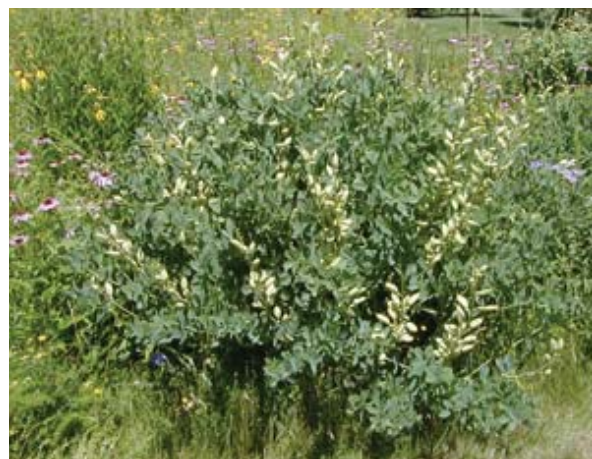
Blue false indigo in a prairie in summer.

3-4 feet tall and wide when mature. The trifoliate leaves are a soft blue-green, alternate and obovate in shape (rounded but wider towards the apex). The foliage remains attractive all season until it dies back to the ground in the winter. The stems should be cut back to the ground in late fall, winter, or early spring before new shoots appear.