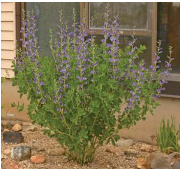
A specimen plant of blue false indigo in bloom.

Every year the Perennial Plant Association chooses a plant of the year. For 2010 this is Baptisia australis , or blue false indigo. This long-lived perennial legume, hardy in zones 3 to 9, has long been a favorite, although underused, garden plant. Native to eastern North American prairies, meadows, open woods and along streams, blue false indigo got its common name because it was once used as a substitute for true indigo ( Indigofera tinctoria , native to southern Asia) which was used to make blue dye. Other common names include blue wild indigo, indigo weed, rattleweed, rattlebush and horse fly weed. B. australis was used medicinally by Native Americans as a purgative, to treat tooth aches and nausea, and as an eyewash.