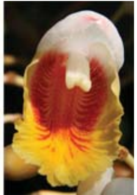
Alpinia zerumbet produces flowers in a terminal raceme (L), with drooping white flowers (LC) that each have a yellow and red interior (RC and R).