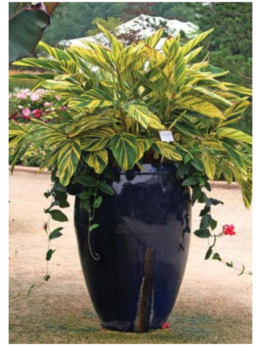
Variegated shell ginger makes a striking addition to containers.

racemes at the ends of the leafy stems rather than directly from the rhizomes. The waxy, funnel-shaped flowers are a pearly white tinged with light pink on the outside, but inside are bright yellow with red markings. It is the appearance of the flowers which resemble pearlescent seashells, especially when in bud, that inspired the common name of shell ginger. The flowers are slightly fragrant when in bloom. Sometimes flowers are followed by striated fruits.