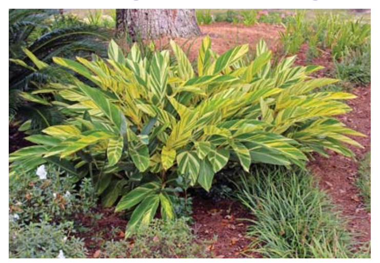
Variegated shell ginger, Alpinia zerumbet "Variegata'.

heavy, fleshy rhizomes that look (and smell) like that of culinary ginger ( Zingiber officinale ). The rhizomes produce stout, slightly arching stems with evergreen leaves. Several dark green, lance-shaped leaves up to 2 feet long grow at intervals along the stems. The species can grow up to 10 feet tall, but in gardens, and especially in northern areas