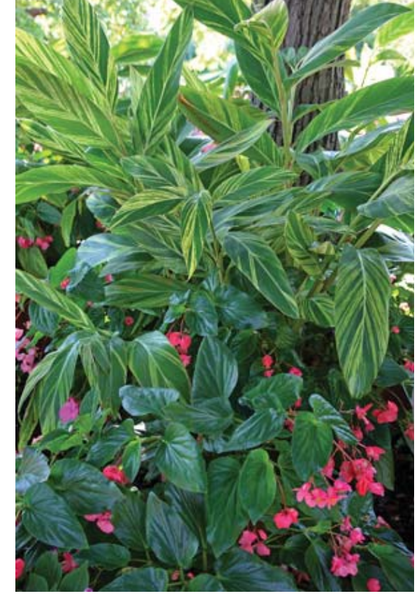
Variegated shell ginger in a mixed planting.

G r o w variegated g i n g e r outdoors in rich, moist soil with lots of organic matter in full sun to part