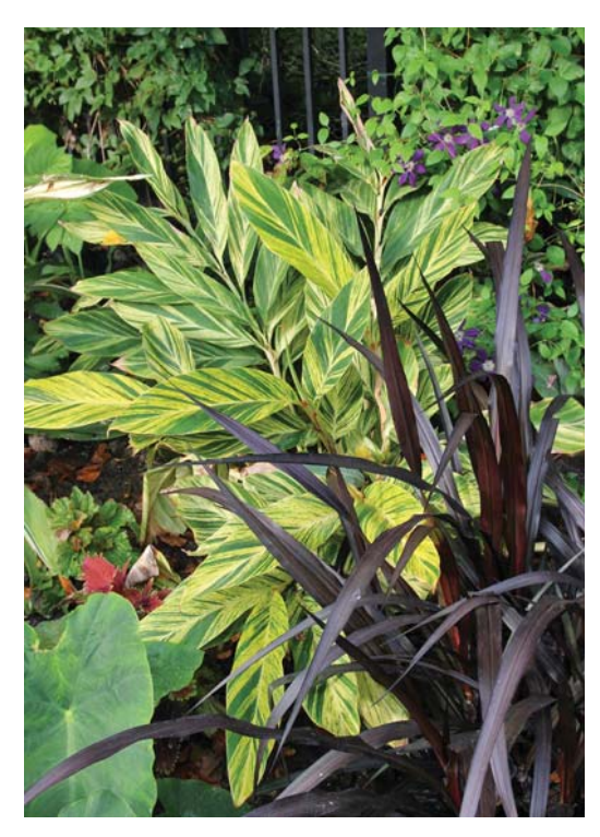
Combine variegated shell ginger with other plants with dark foliage for a dramatic effect.