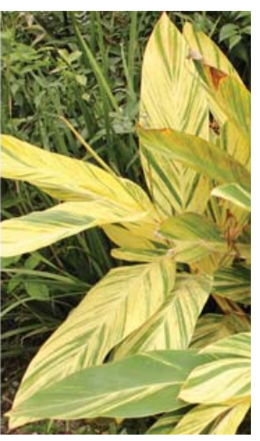
The amount of variegation on the leaves varies a lot.

plants grown as annuals or stored for the winter. Unlike most gingers, this species produces drooping