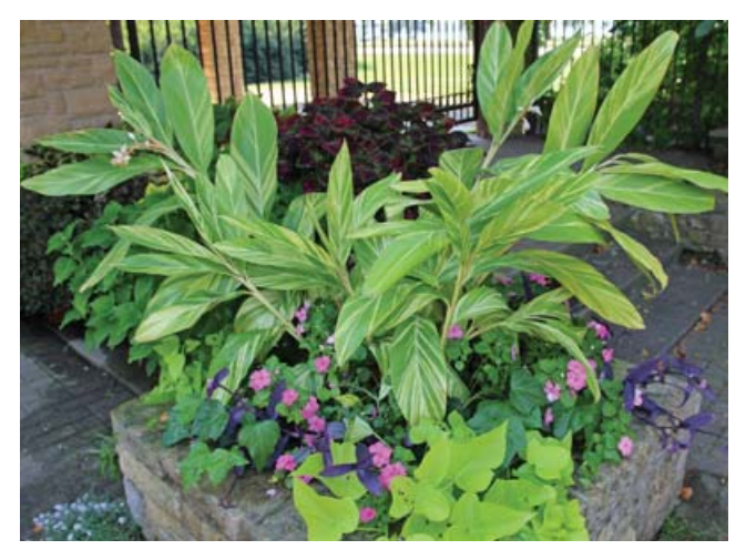
Variegated shell ginger in a seasonal container.

contrast, and use it to brighten up a lightly shaded area. Mix variegated ginger with banana plants, castor bean ( Ricinus communis ) and elephant ears for an exotic foliage garden.