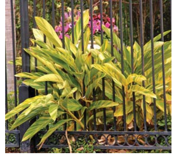
Variegated shell ginger is widely used as a tough landscape in mild climates.

where grown as an annual, they generally only get 3 or 4 feet tall. The cultivar 'Variegata' is a smaller, more